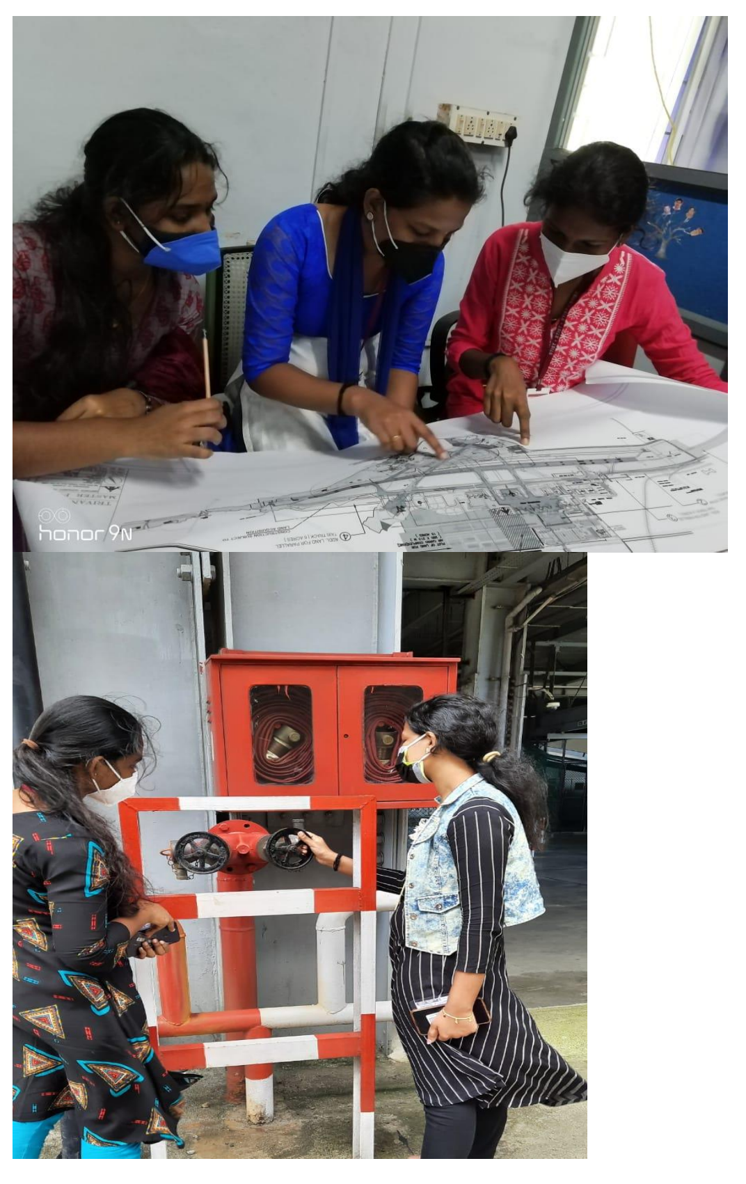
CE students @ AAI Internship