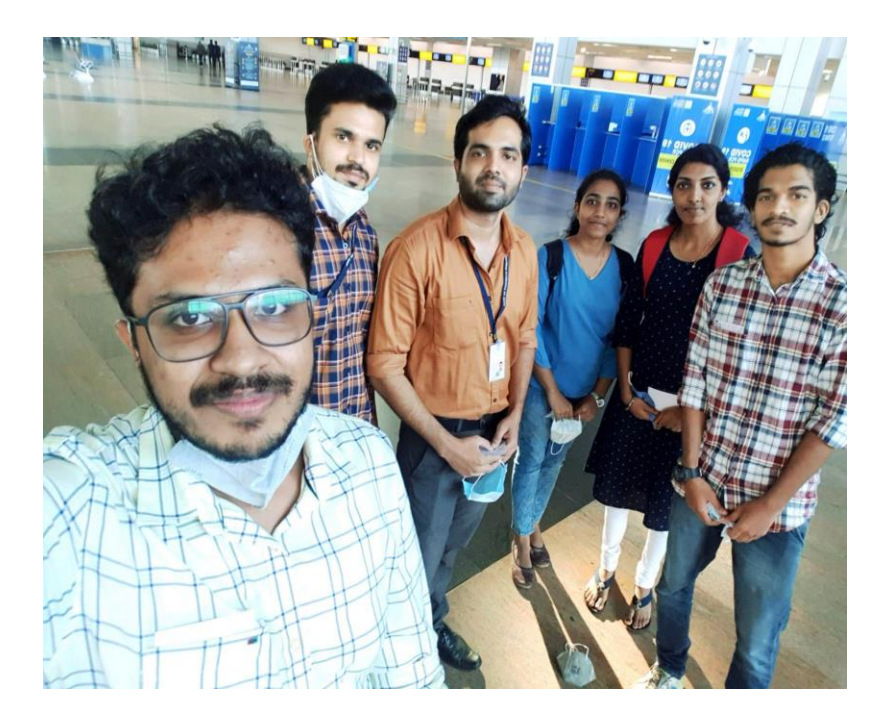
CSE students @ AAI Internship