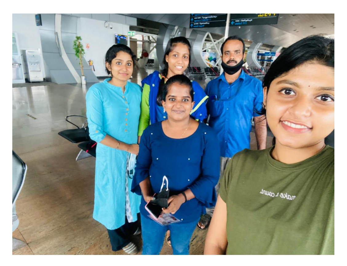
EC students @ AAI Internship