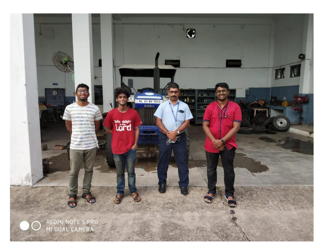
ME students @ AAI Internship