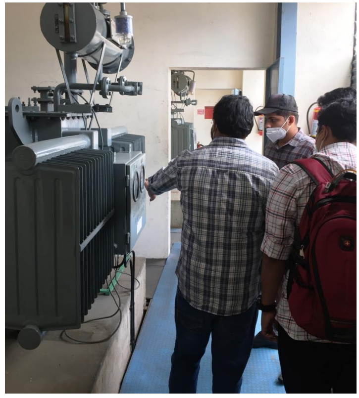
EEE students @ AAI Internship