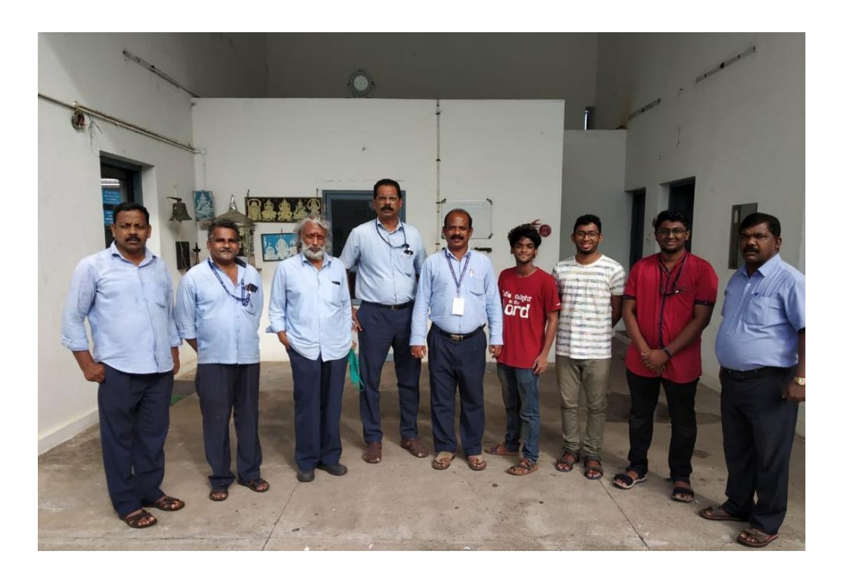
\ensuremath{\mathsf{ME}} and \ensuremath{\mathsf{EC}} Students of STIST underwent % (x,y) internship at Airport Authority of India , Trivandrum